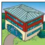
At your office . . .

Watch the conference in live streaming video over the Internet and at your convenience at any time 24/7 for six months following the event.