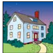
. . . or home

The archived conference includes speaker videos and coordinated PowerPoint presentations.