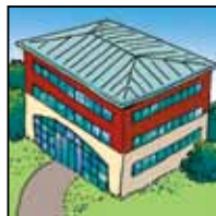
At your office ...

Watch the conference in live streaming video over the Internet and at your convenience at any time 24/7 for six months immediately following the event. The archived conference includes speaker videos and coordinated PowerPoint presentations. PROS: Live digital feed and 24/7 Internet access for the next six months; accessible in the office, at home or anywhere worldwide with Internet access; avoid travel expense and hassle; no time away from the office.