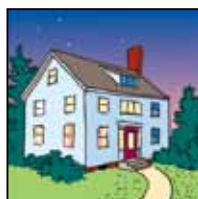
... or home