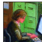
At your office ...

PROS: Live digital feed and 24/7 Internet access for next six months; accessible in office, at home or anywhere worldwide with Internet access; avoid travel expense and hassle; no time away from the office.